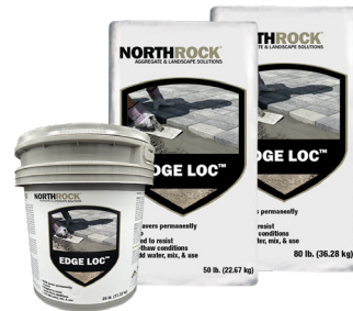
NorthRock® Edge Loc