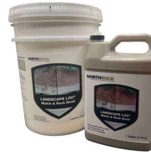
NorthRock® Landscape Loc® Mulch & Rock Bond